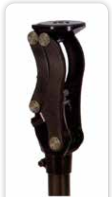
Endolite 4-Bar Knee

Polycentric knees, often referred to as “four bar” knees, are the most mechanically complex design with multiple axes of rotation. They can be set up to be very stable during early stance phase, yet easy to flex to initiate the swing phase or to sit down.