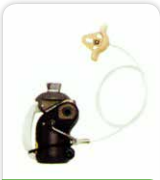
Ottobock 3R40 Locking Knee

need. A manual-locking knee can be locked to keep the leg straight when walking and, by the pull of a lever or cable, unlocked to bend the leg for sitting. There is some inherent danger in using a locked knee when walking – in the event of a fall, it is impossible to control the direction of your fall