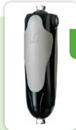
Mauch SNS Hydraulic Knee

MPKs create a more natural gait, with amputees reporting that they don't have to think about each step they take. Some of the knees currently on the market are Kenevo, C-Leg Compact, C-Leg, Genium and X3 from Ottobock; Rheo, Power Knee and Symbiotic Leg from Össur; Orion and Smart IP from Endolite; Plié from Freedom Innovations; Hydracadence from Proteor; and Rel-K from Rizzoli Ortopedia. The drawback to this type of knee is its high cost.